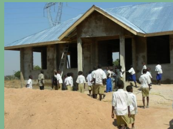
The Nala Library

This spring of 2011 we will begin a campaign to collect and purchase books for the library. More information about this will be available soon.