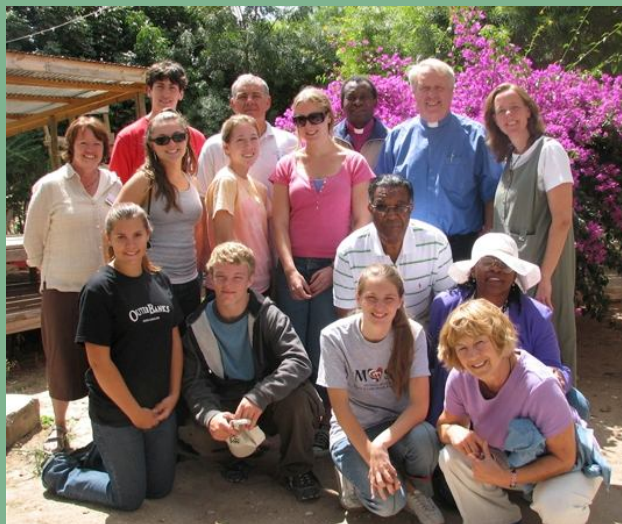
Our 2006 group of pilgrims

Since 2006, 8 youth and 5 adults from St. John's have made pilgrimages to Tanzania to meet our Carpenter's Kids in the village of Nala. Through our commitment and dedication St. John's has been sponsoring 70 HIV/AIDS orphans for the past 5 years and would like to like to continue to do so.